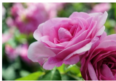
"Gertrude Jekyll" Rose

Big pointed buds open to a show of broad petals of pure white and black-green leaves to make the flowers stand out even more. This rose has an intense super-fragrance of sweet citrus.