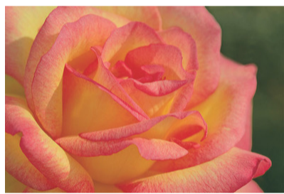
"Sheila's Perfume" Rose

New this year, this shrub rose can be grown in a container or in a garden bed. Its fragrance is of strong tea and is a repeat bloomer with peach colouring.