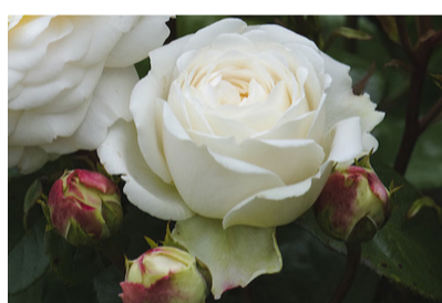
"Tranquility" (Ausnoble) Rose

This rose can be grown as a bush rose or as a climber. It produces large rosette-shaped, glowing, pink flowers that have a very strong, old rose fragrance.