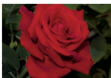
"Drop Dead Red" Rose

Fragrant – also known as the Thornless Rose. This rose has large, double blossoms throughout the season.