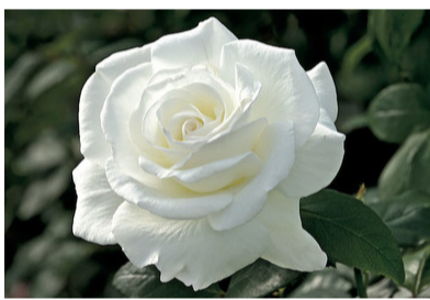
"Sugar Moon" Rose

The large double flowers of this rose are yellow and brushed by deep pink. This rounded bush has a strong rose and fruit fragrance.