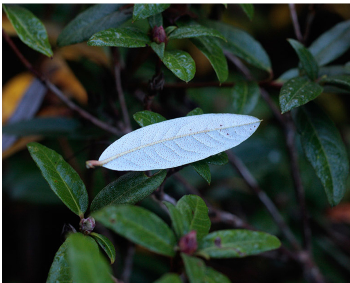
Rhododendron glaucophyllum by Beryl Zhuang